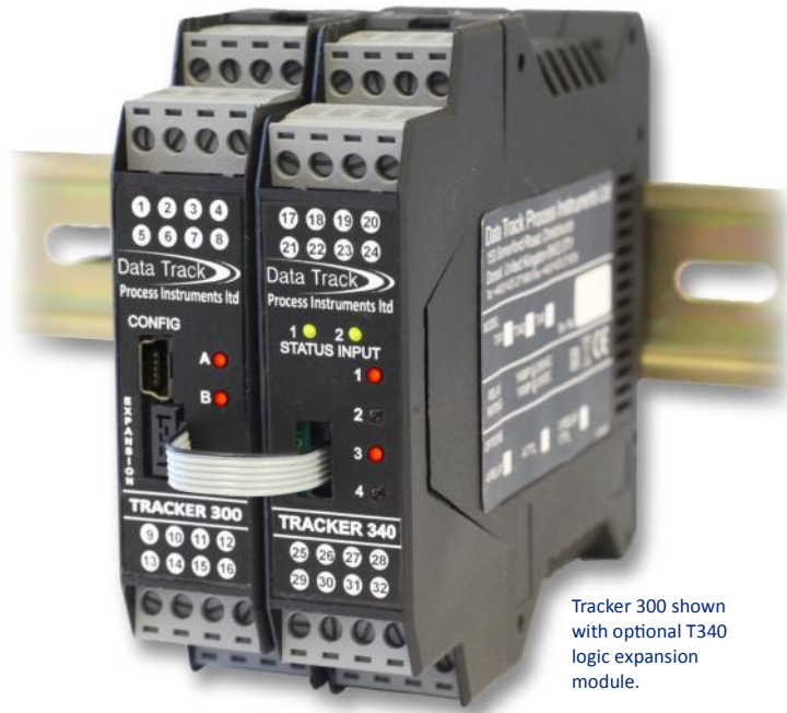
Tracker 300 shown with optional T340 logic expansion module.

For Signal Conditioning, Data Acquisition, PID Control and Alarms