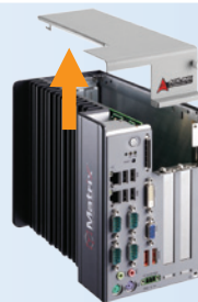
2. Withdraw the thumbscrew and remove the top cover