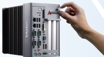
1. Undo the thumbscrew by hand